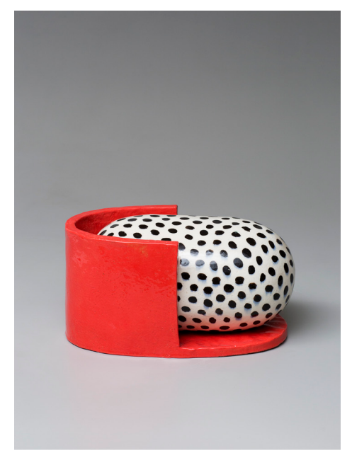
Untitled, Construction, 2014, hand built glazed ceramics 8 3/4 x 10 1/4 x 9 1/2 inches