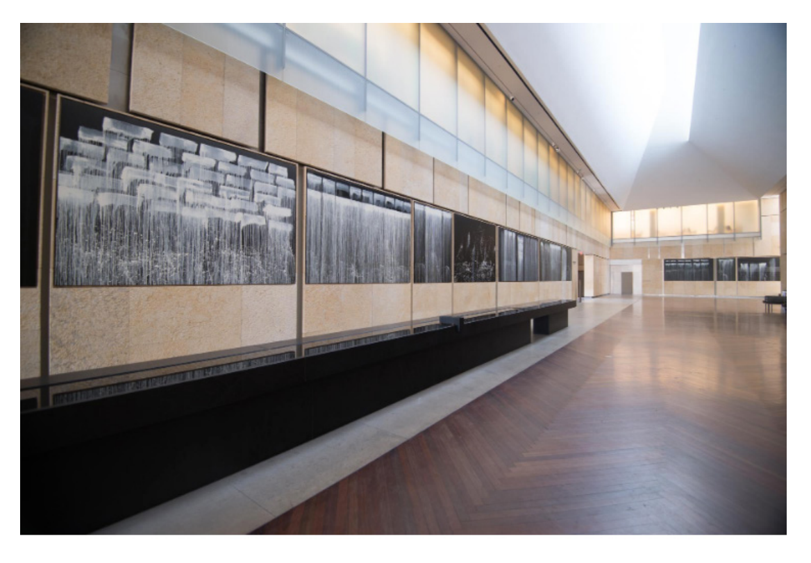
Installation view of "Pat Steir Silent Waterfalls: The Barnes Series," 2019, at the Barnes Foundation, Philadelphia.

@ 2019 ARTNEWS MEDIA, LLC. ALL RIGHTS RESERVED. ARTNEWS^ IS REGISTERED IN THE U.S. PATENT AND TRADEMARK OFFICE.