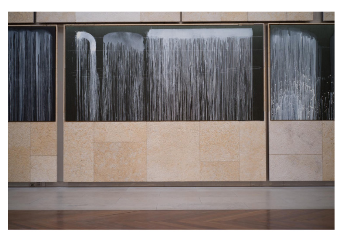
Installation view of "Pat Steir Silent Waterfalls: The Barnes Series," 2019, at the Barnes Foundation, installation view.

by phyllis tuchman Published: July 30, 2019