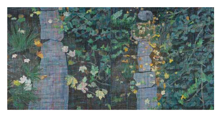
"Path," 2011. Oil on canvas (diptych). 60 x 120".

completely abstract and minimal ones that were similar to my early Dot pieces, where I'd mix up 250 colors and each one would have a specific combination of the colors used.