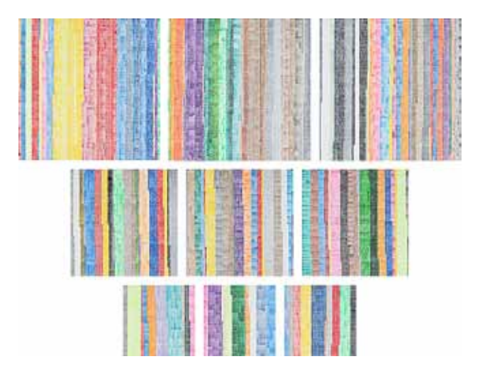
"Lg. M. Sm. 1-500 Vertical," 2011. Enamel over silkscreen grid on baked enamel steel plates. 57 x 75".