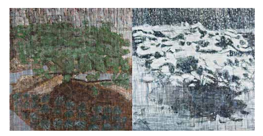
"White Pine," 2010. Oil on canvas (diptych). 72 x 144". Courtesy of the artist and Locks Gallery.

trying to get off. I thought it was fabulous; it seemed so New York to me. So sure, I felt completely at home in New York as soon as I set foot on the street.