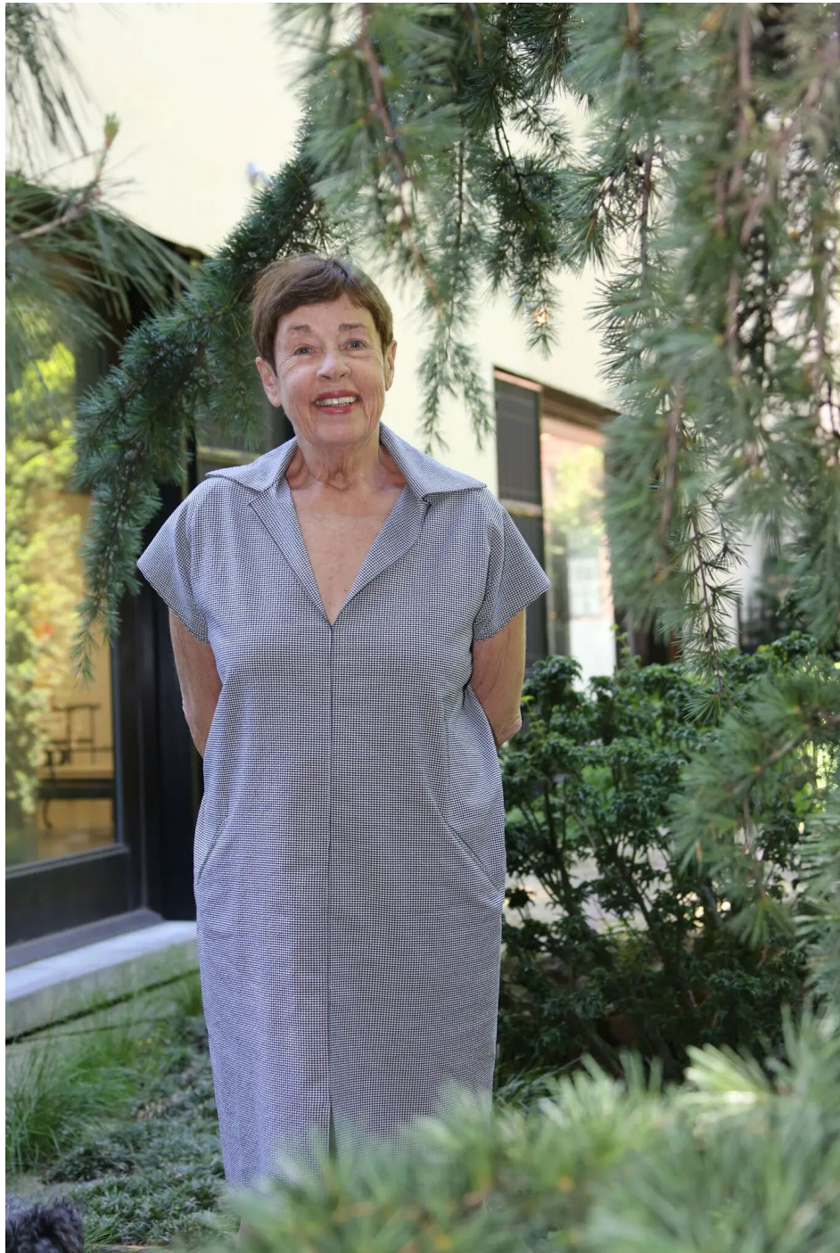
Ms. Bartlett in an undated photo. She worked from life in creating art, in particular her immediate surroundings, including, eventually, her studios, homes and gardens.