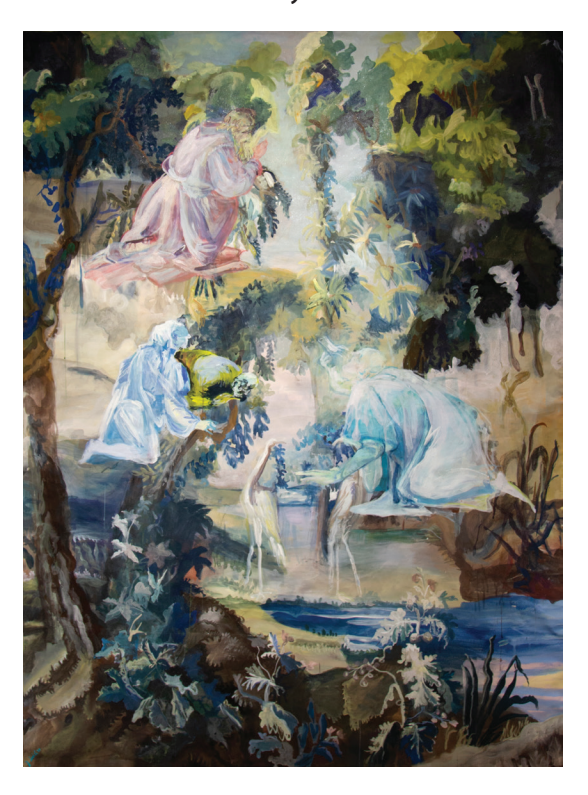
Jane Irish, Supplicant, 2020, distemper and oil on hand-stitched linen and muslin, 78 x 56 inches

Pat Steir's paintings are a phenomena in their own right, deftly employing gravity and the fluid properties of oil paint to form chance-driven compositions that drip down and splash across the surface in luminescent layers.