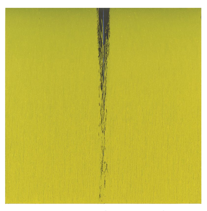
Pat Steir, Yellow One, 2018, oil on canvas, 60 x 60 inches

September 9 - September 12 Javits Center, New York City Booth 214