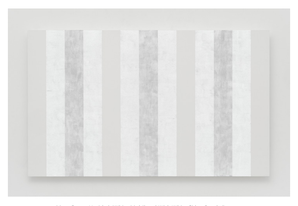
Mary Corse, Untitled (White Multiband With White Sides, Beveled) , 2023, acrylic and glass microspheres on canvas, 58 x 96 x 4 1/2 inches

Artist Reception: Thursday April 3, 5–7pm