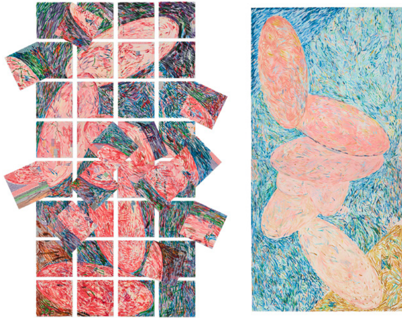
Jennifer Bartlett, Tidal Wave II , 1978, enamel over silkscreen grid on forty-four baked enamel steel plates; and oil on canvas, two panels; overall dimensions: 103 x 144 inches

Locks Gallery is pleased to present an exhibition of large-scale works by Jennifer Bartlett from her Swimmers series (1978–1980), alongside her monumental piece, Atlantic Ocean (1984), made up of two hundred and twenty-four steel plates.