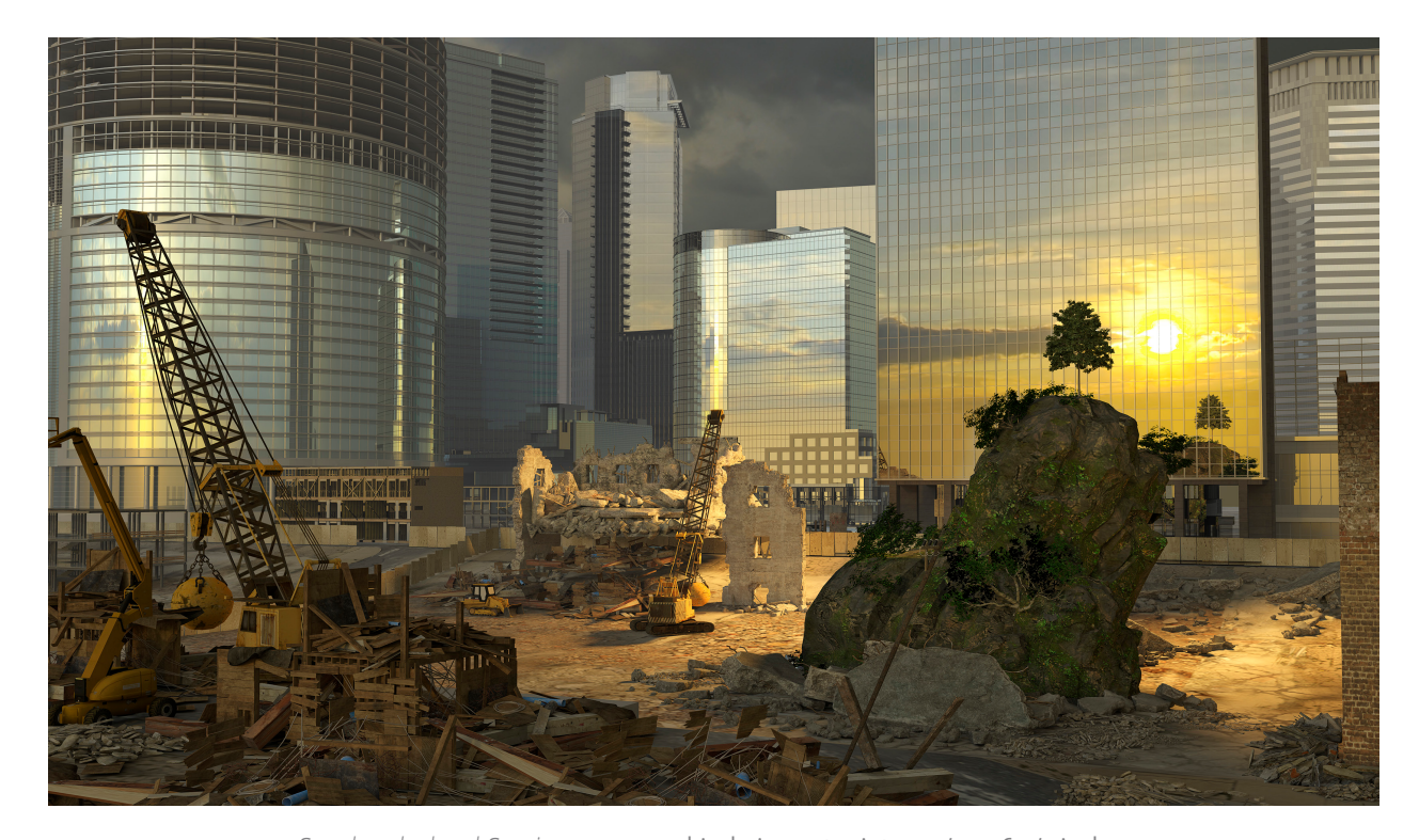
Sun-drenched and Spacious, 2020, archival pigment print, 43 1/2 x 56 2/3 inches