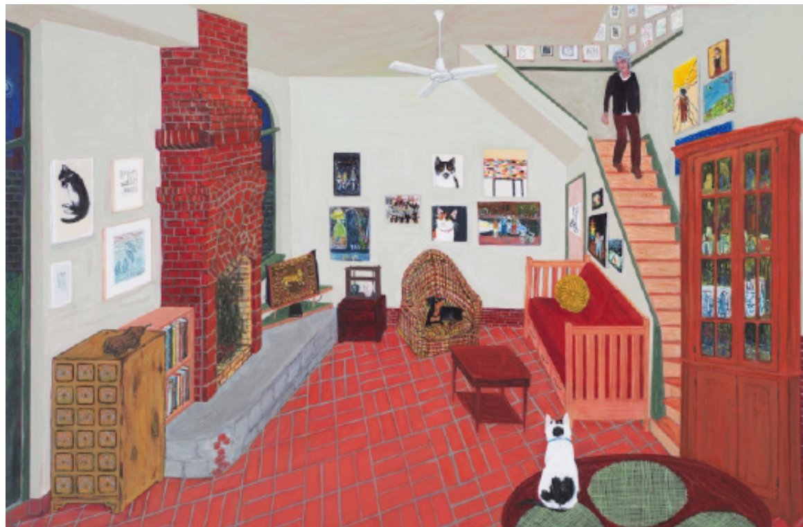
Sarah McEneaney, "Home" (2017), acrylic on wood, 24 x 36 in