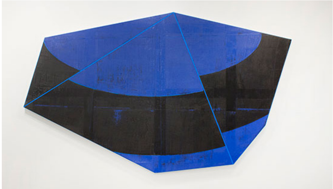
David Row, Counter Clockwise, 2018. Oil on canvas, 65 x 110 inches.

Much of David Row's earlier abstraction was predicated on dark, often curved bands that meandered over textured monochromatic fields. Curves have also appeared with frequency in his subsequent development, though with each iteration they are put to surprisingly different use. Like many abstract painters, Row works in series. And this latest, of relatively small paintings, continues with the irregularly shaped canvases he has contended with for several years now, but with a few notable changes typical of his restive approach