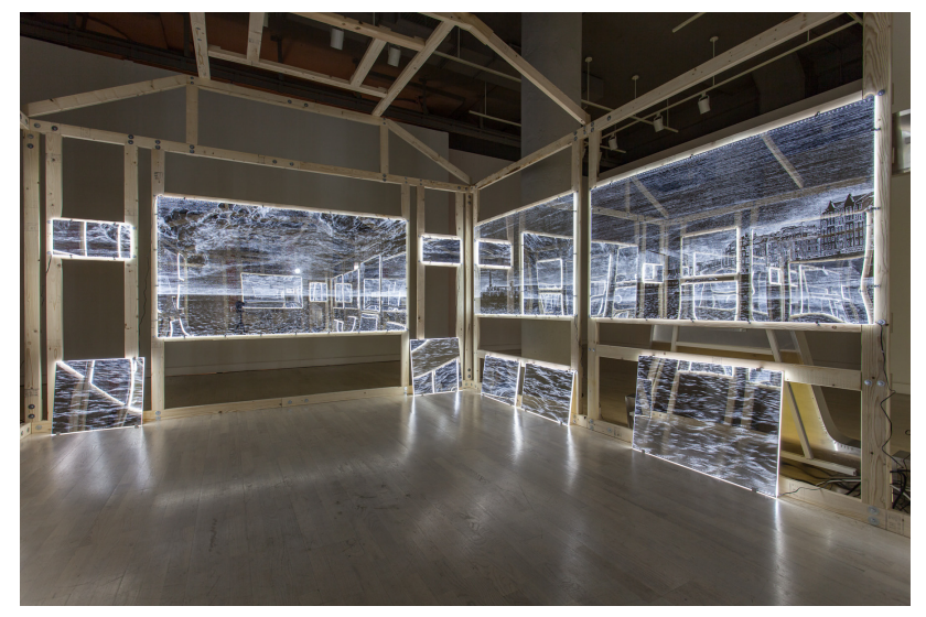
Inside the recreation of Turner's gallery.

The installation at Locks is a three-quarters-scale recreation of the Turner Contemporary version. The inside is outfitted with thirty-four engraved mirrors mounted on light boxes that are replicas in size and positioning, but not subject matter, of the works in Turner's personal gallery at the time of Turner's death. The subjects of Turner's paintings, including scenes from Margate as he knew it, have been replaced here with components of a 360-degree view of contemporary Margate. The engravings provide the visitor with a ghostly, darkened view of modern Margate, complete with the garish modern additions to the landscape, and the sea below it. There are vague hints of Margate's former beauty, but not many.