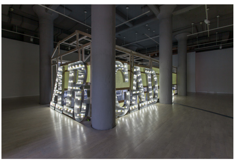
The "ARCADIA" sign.

Think of your childhood, and think of the vacation destinations and summer retreats whose every detail you can still conjure up to this day. Chances are, these places have been demolished, redone, or otherwise completely changed from what you knew. Ellen Harvey's installation "Arcade/Arcadia" at Locks Gallery captures the strangeness and alienation of seeing the town of your youth overrun by the modern era.