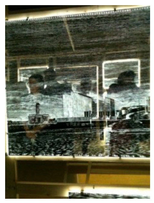
An image from the landscape.

The installation at Locks is a three-quarters-scale recreation of the Turner Contemporary version. The inside is outfitted with thirty-four engraved mirrors mounted on light boxes that are replicas in size and positioning, but not subject matter, of the works in Turner's personal gallery at the time of Turner's death. The subjects of Turner's paintings, including scenes from Margate as he knew it, have been replaced here with components of a 360-degree view of contemporary Margate. The engravings provide the visitor with a ghostly, darkened view of modern Margate, complete with the garish modern additions to the landscape, and the sea below it. There are vague hints of Margate's former beauty, but not many.