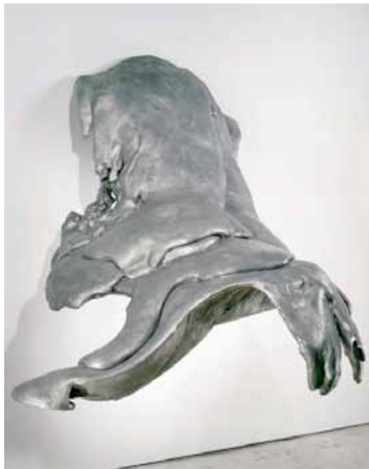
Wing , 1970, cast aluminum

Museum of Contemporary Art , 250 S. Grand Ave., (213) 626-6222, through Oct. 10. Closed Tues. and Weds. www.moca.org