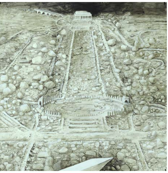
Alien Souvenir Stand (detail of hanging painted sign), Ellen Harvey, 2013. Oil on aluminum panel. 48 x 48 inches.

The pandas at the National Zoo are locked away, the Smithsonian museums are shut down, the steps of the Lincoln Memorial are barricaded. But luckily the most delightful—and certainly the weirdest—exhibition in Washington is still open for a few more days.