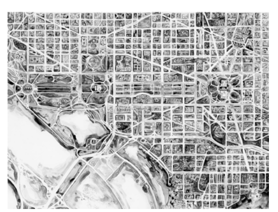
The Alien's Guide to the Ruins of Washington, D.C. (detail), Ellen Harvey, 2013. Print on paper. 18 inches by 24 inches.