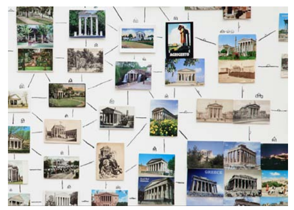
The Pillar-Builder Archive (detail), Ellen Harvey, 2013. Approximately 3,000 posrcards, acrylic paint, and tape.