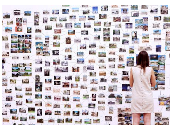
The Pillar-Builder Archive (detail), Ellen Harvey, 2013. Approximately 3,000 posrcards, acrylic paint, and tape.