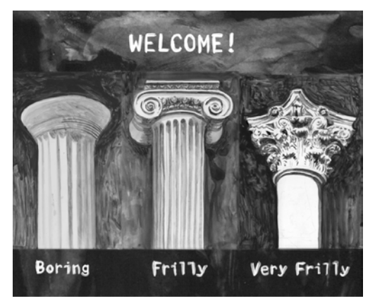
The Alien's Guide to the Ruins of Washington, D.C. (details), Ellen Harvey. Print on paper. 18 inches by 24 inches.