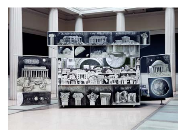
Alien Souvenir Stand, Ellen Harvey, 2013. Oil on aluminum, watercolor, and latex paint on clayboard, wood aluminum sheeting, propane tanks, and velcro. 10 feet by 17 feet by 5 feet. Fabrication assistance: KBC Design.