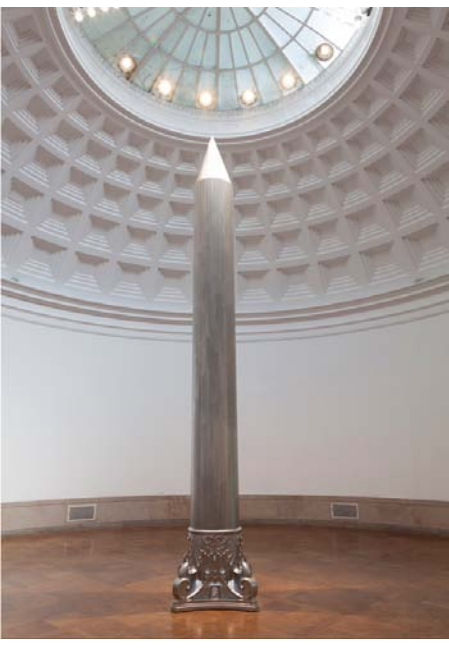
Alien Space Ship: The Latest in Pillar-Builder Space Travel, Ellen Harvey, 2013. Aluminum. 23 feet.