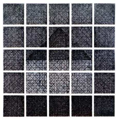
"House: Lines, Black" (1998) Collection of Ron Shamask

The house, rendered as a banal, abstract pictogram, became a recurring form for Bartlett: a geometric box that is universal and domestic; a subject favored by feminist artists during the women's movement, and yet not too far from the minimalist cube, with its cool, cerebral overtones. Two later works, "House: Lines, Black" and "House: Lines, White,"