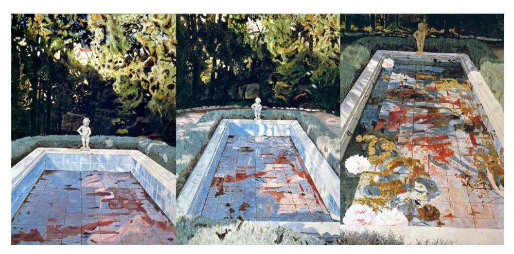
"Pool" (1983), oil on three canvases

opus, "Rhapsody" (1975-76), a massive work consisting of 987 steel plates which is also an important piece of art history: When it was first shown in Paula Cooper's gallery in SoHo, it filled the entire space and was painted with the 25 colors then available in Testors enamel. (Having the colors in your work determined for you by a paint manufacturer rather than mixing them to your personal preference was a gesture favored by many artists in the 20th century.)