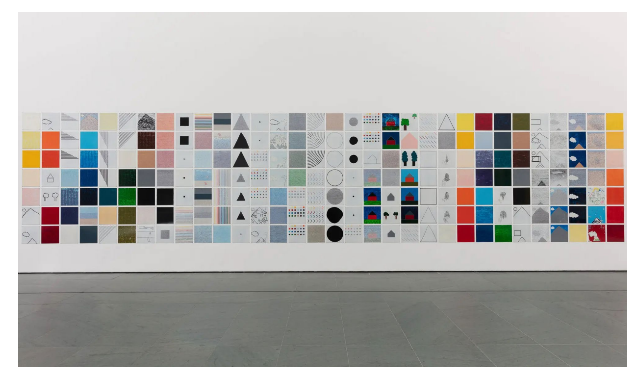
"Rhapsody" on view at the Museum of Modern Art in 2019.

Reviewing "Rhapsody" in The New York Times, the English critic John Russell called it "the most ambitious single work of new art that has come my way since I started to live in New York." It summed up aspects of Pop, Minimalism, and Conceptual and process art, while also opening art anew to images, narrative, repeating patterns, appropriation and stark juxtapositions that continue to inform painting.