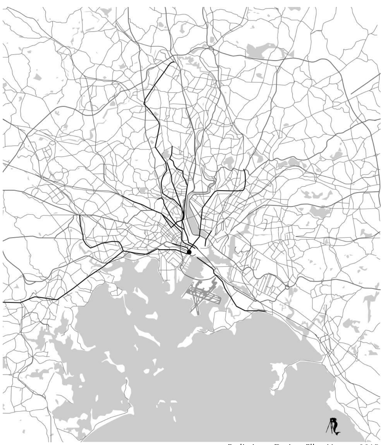
Preliminary Design, Ellen Harvey, 2015