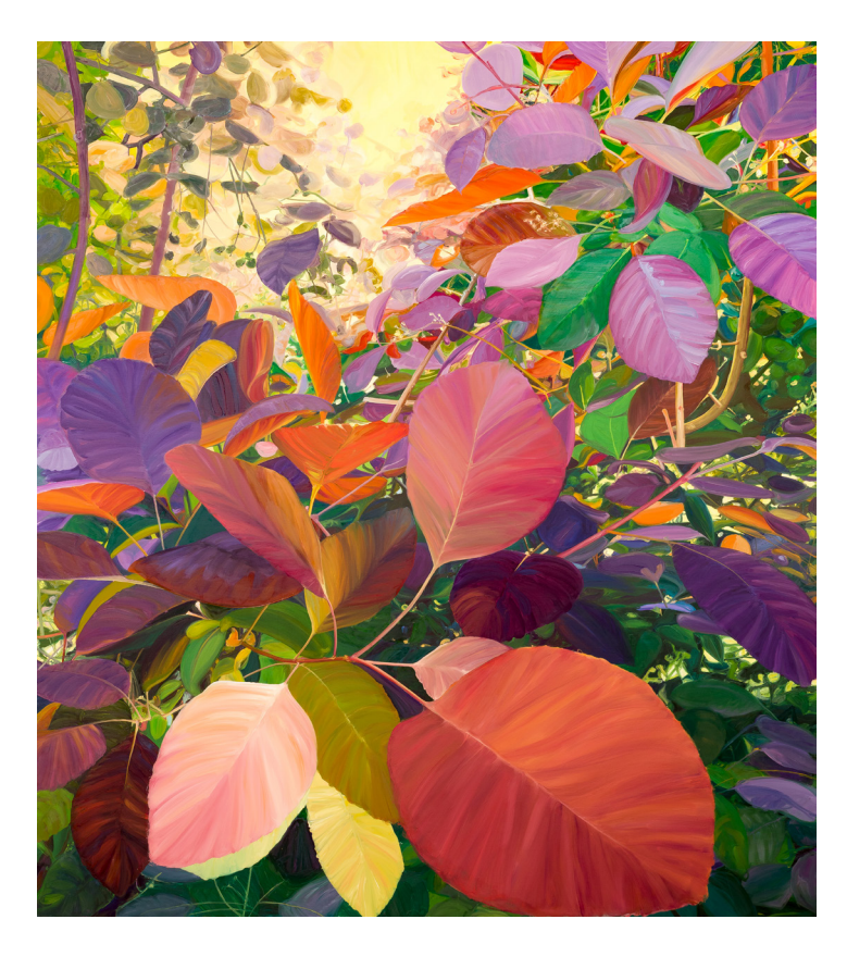
Holloway, 2017 oil on canvas 75 x 57 inches