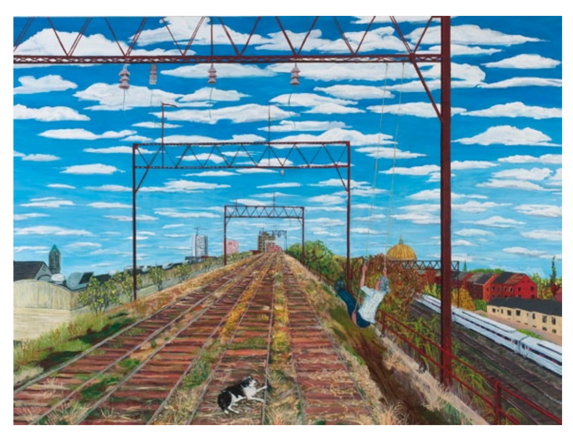
Viaduct, West Poplar, 2013, egg tempera on wood, 36 x 48 inches

of her martyrdom. Her left hand holds a small brush tipped with sanguineous paint held against the vein of her right arm, closing a circle between her blood and her paint, her life and her art.