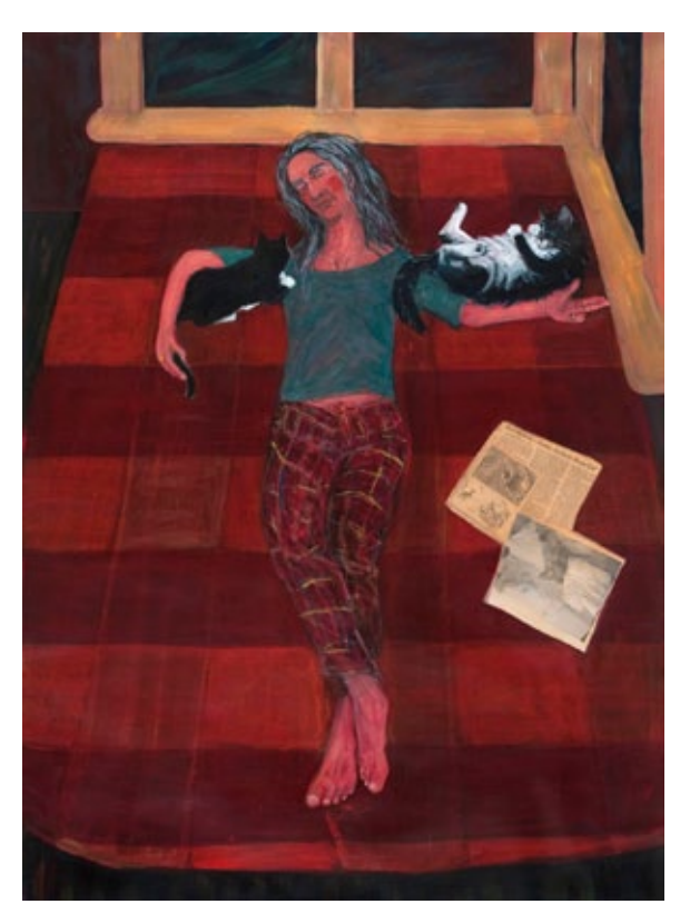
Red Cross, 2011, acrylic and collage on paper, 48 x 36 inches

red bedspread and McEneaney's pajama bottoms: suffering becomes cozy slumber, companionship, and menstruation as cyclical life force rather than Christ's fatal bleed. This is a highly unusual painting for McEneaney, materially in its use of acrylic and collage on paper, chromatically in its relative darkness, and thematically in its overt use of the crucifixion, but for all these reasons I find it fascinating and revealing.