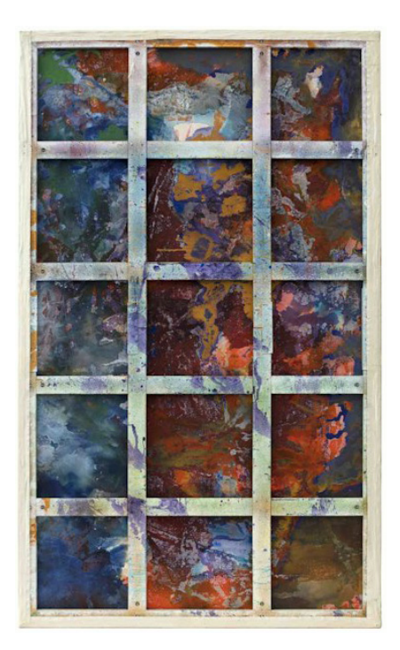
Dona Nelson, Phigor (letf: front; right: back), 2014, acrylic paint, soft gel medium, and tar gel medium on double-sided canvas with raw steel stand, 117 x 70 inches. Collection of Timothy Phillips.