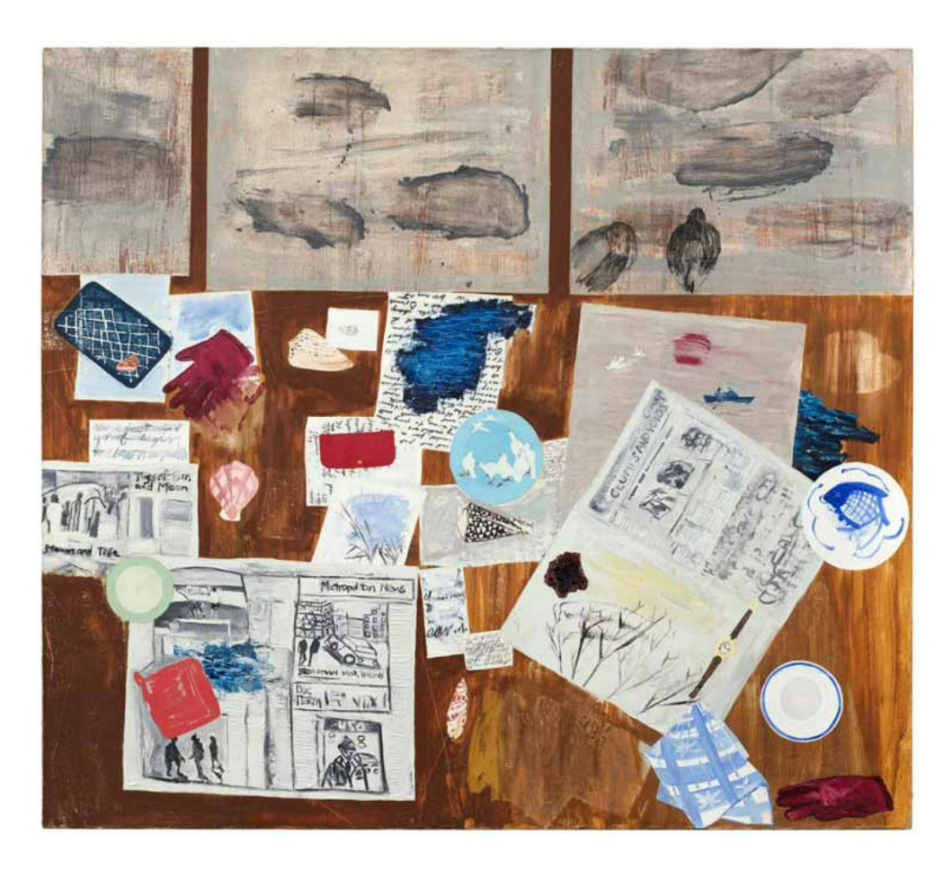
Dona Nelson, Table Top , 1987, oil on linen, 75 1/4 x 84 x 2 inches. Tang Teaching Museum.

plate—there's a plate I actually own with some pigeons on it, an old plate.