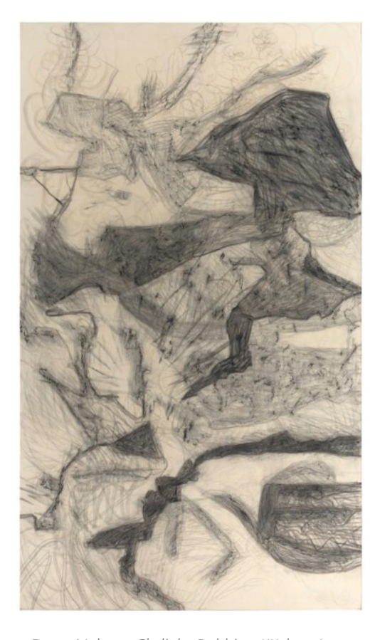
Dona Nelson, Skylight Rubbing, Walnut Lane Summer, 2002, graphite and acrylic medium on canvas, 126 x 72 inches.