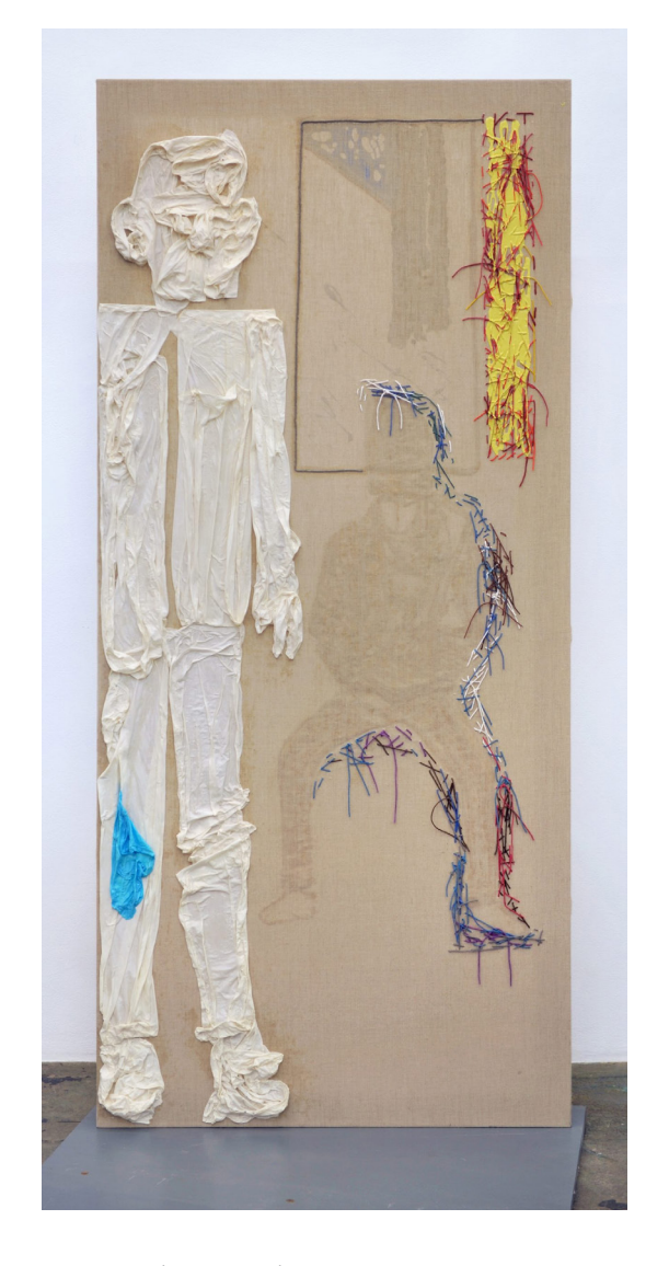
Dona Nelson, "Studio Portrait Over Time" (2016), cheesecloth, muslin, painted string and acrylic mediums on linen, 81 x 36 x 5 inches; base 38 x 32 inches

In this same painting, just to the right of the standing figure is a vertical line